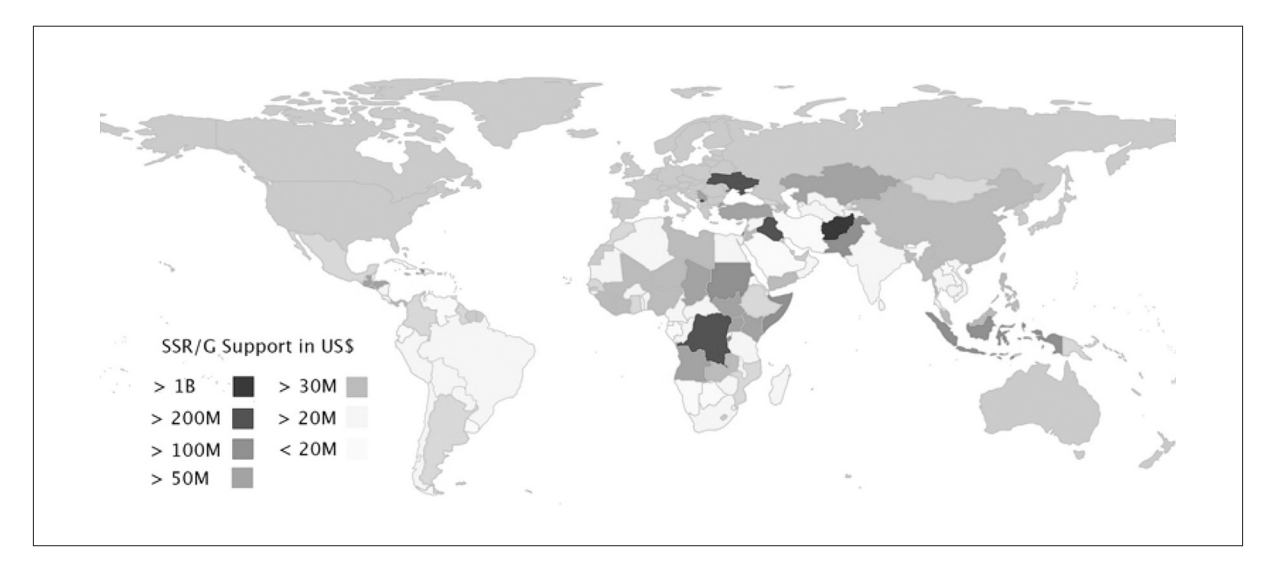
Figure 2: Aggregated Western donor SSR/G budget (2007–2016) as accounted by OECD-DAC

in total were sponsored with a total amount higher than 100 million US dollars. The lion's share of the entire western SSR/G budget, 47 percent, was divided among only five countries, Afghanistan, Iraq, Kosovo, Ukraine and the Democratic Republic of Congo. Afghanistan alone received 22 percent of the overall budget (see Figure 2).