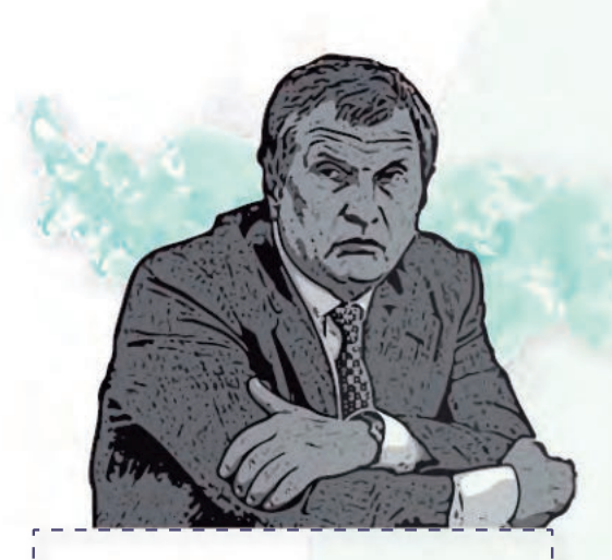
Governance breakdown and violent conflict

Tipping Point 1: Putin's resignation without the prospect of an immediate strong successor sparks enormous political uncertainty in Moscow. It is seen and used as a window of opportunity for aggressive state and non-state actors in the region to turn long-standing territorial claims into new realities on the ground, including by (re-)starting violent conflicts.